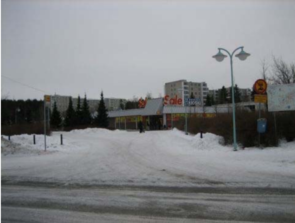
View on the `center` of Lauste, a suburb at a distance of 7 kilometers from the center of Turku. The building in front houses a supermarket, a café and a small convenience store. Apartment blocks in the background, situated in a landscape of woods.

that have developed in Turku cannot be broken up. We must approach the issue from the viewpoint of attempting to keep the growth of these areas in check and prevent the problems that are likely to develop in these areas” (Ibidem, p. 6).